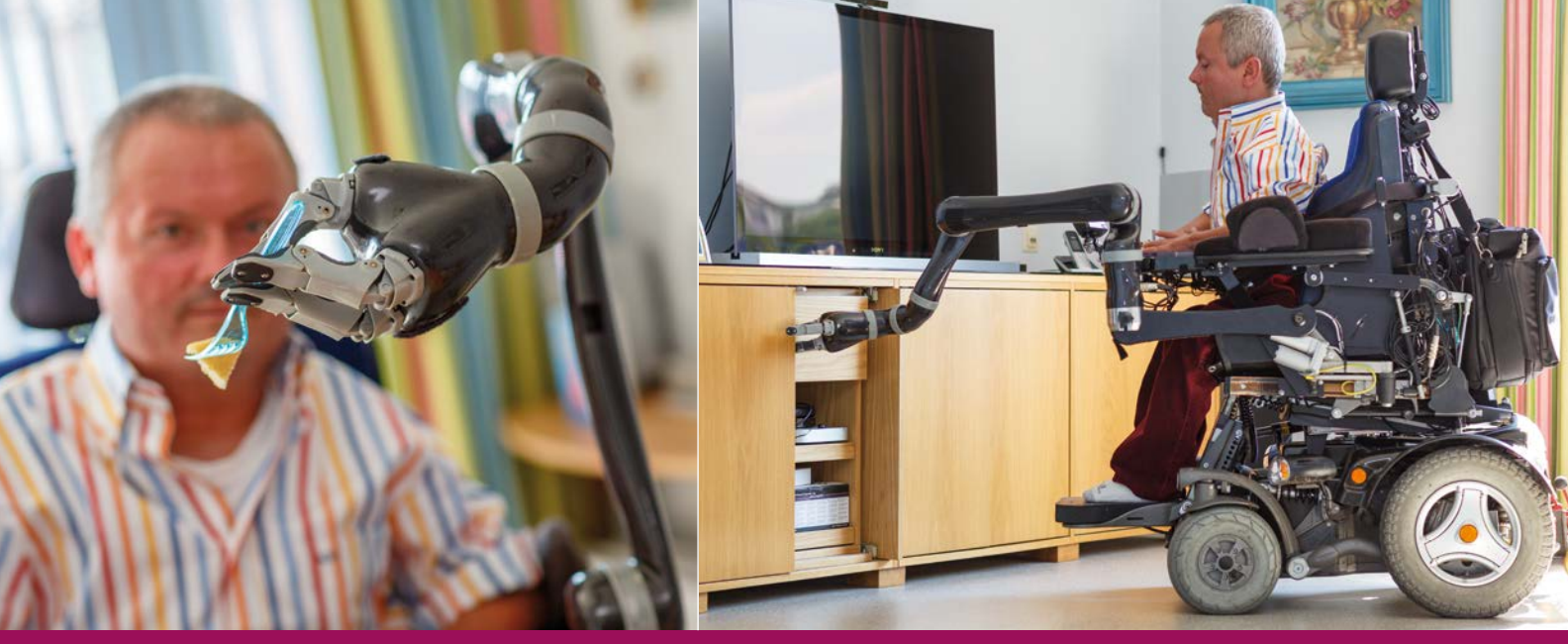
Jaco makes it possible to eat independently