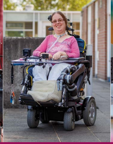
· Jaco does not increase the width of the wheelchair and can be folded away out of sight of the user