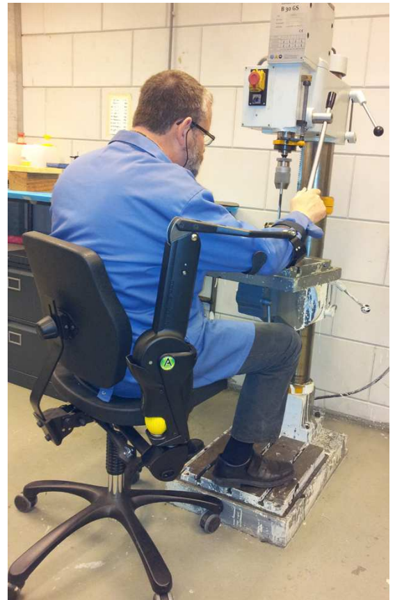
Relieves the pressure by Armon Pura on arms / neck / shoulder in the static work