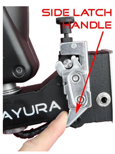
Steps 4 and 5